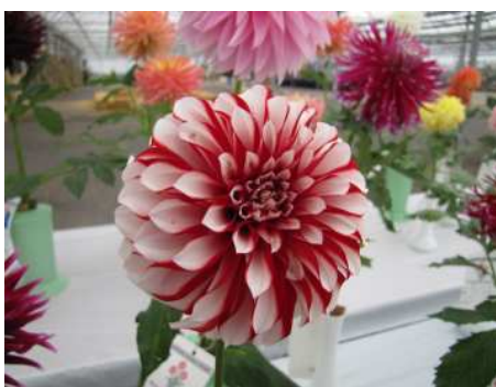
A ST BI W/R Boley seedling entry

I have discovered that by the end of next season I will have been the DSO Judging Chairman for 5 years. Time does fly when you are having fun, doesn't it! The fun is the good news. (I hope you agree!) The not-so-good news is that we need to go through the process of renewing our judging credentials every five years.